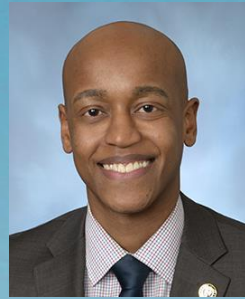
Girmay H. Zahilay King County Councilmember Equity Champion for All The Right Work – Right Now